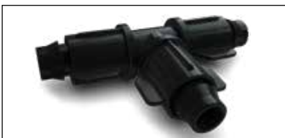
Smart-Loc™ Compression Fitting