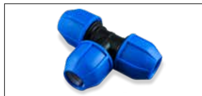
NORMA PN 16

You need help or want to know more? Feel free to consult our specialists!