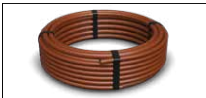
Dripline Dura Flo™ CV

Love what you see? Here are some more products you may like.