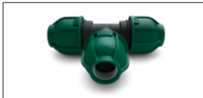
NORMA PN 10