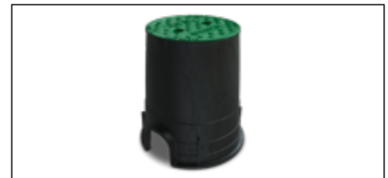
NDS Valve Box

You need help or want to know more? Feel free to consult our specialists!