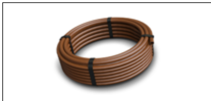
NORMA PC Dripline

Love what you see? Here are some more products you may like.